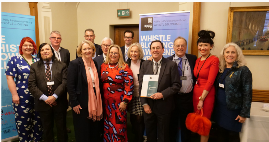
Pic: The launch of Whistleblowing Awareness Week 2023

WhistleblowersUK have undertaken to collaborate in the review and share our research and facilitate meetings with whistleblowers. If you would like to provide evidence to the review please complete the survey on our website and tell us about your experience and if you would like to attend in person or on zoom meetings.